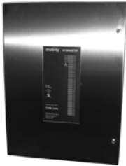
Hydrastep Control Unit

A Hydrastep electronic steam/water gauging system comprises:-