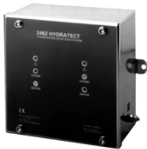
Hydratect Control Unit